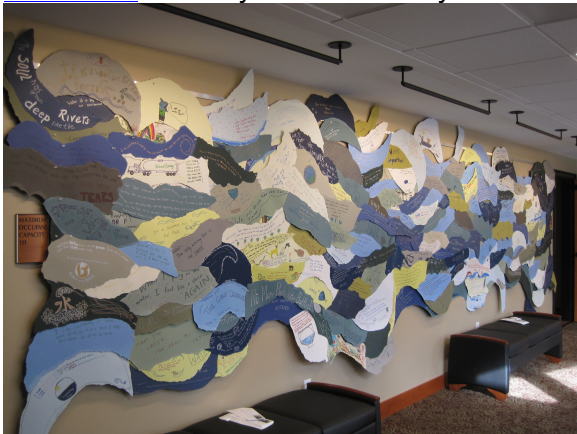
The Lamprey River "Stream of Conscience" art installation at the Durham Public Library

people who have done their share to make sure the Lamprey is an asset to all for now and the future. If you would like to view this video, please visit http://www.lampreyriver.org/multi-media-videos-reflections or visit your local library.